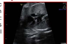
Figure 2: Ventricular Septal Defect

In this retrospective case-control study, Chaoui et al evaluated the width of CSP as a function of BPD in 260 normal fetuses at 16-34 weeks of gestation, and 37 fetuses with confirmed deletion 22q11 with various CHD. The width of the CSP was obtained in the axial transventricular plane with the calipers placed on the inner borders (Figure 1). There was a significant linear relationship between the CSP and the BPD. Z-scores were calculated. In the fetuses with deletion 22q11, there was a statistically increased CSP > 95th centile in 25/37 (67.5%) of cases. This was more pronounced in fetuses beyond 22 weeks who had a BPD of more than 50 mm: in this subgroup the CSP was increased in 24/28 (85.7%).