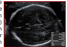
Figure 1: Axial Transventricular Plane

DiGeorge Syndrome (deletion 22q11) is the most common deletion in humans. It is the most common chromosomal abnormality in infants with congenital heart defects (CHD) secondary only to trisomy 21. Today, though certain laboratories offer NIPT screening for it, a high index of suspicion is needed in order to rule it out. From Chaoui, who first discussed the role of the thymic/thoracic ratio as a sonographic marker for deletion 22q11, comes the new sonographic marker: dilated cavum septum pellucidi (CSP). This study was recently published in the journal Prenatal Diagnosis .