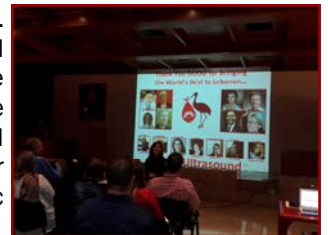
Basic Training Lebanon Satellite