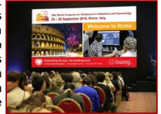
ISUOG Rome 2016