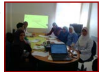
SANA's Trainees in Akkar