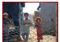
In Spite of it All...