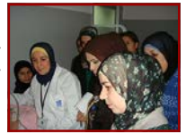
SANA's Trainees at GHSD