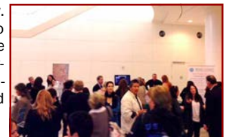
Attendees Gathering in the Lobby