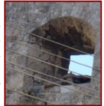
A Sniper's Post on the Way