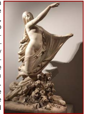
The Sleep of Sorrow & The Dream of Joy